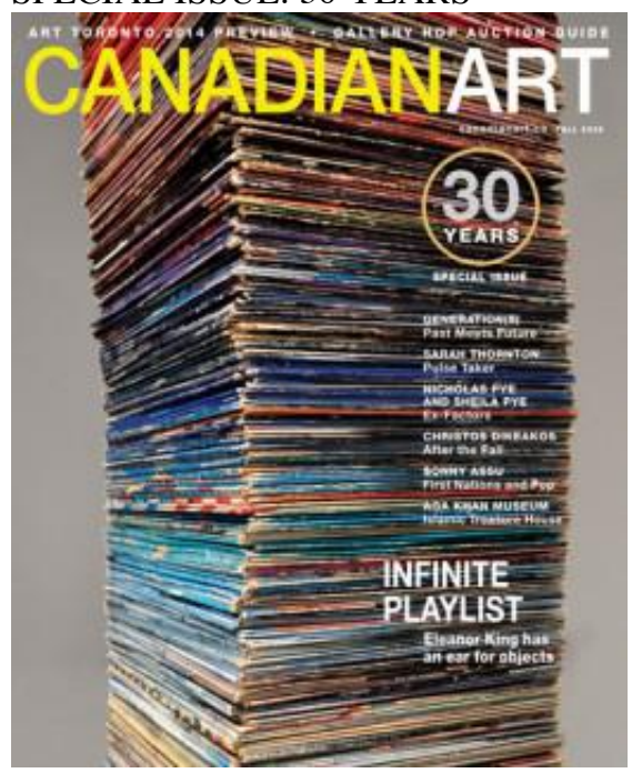
SUBSCRIBE TO THE MAGAZINE // Reviews