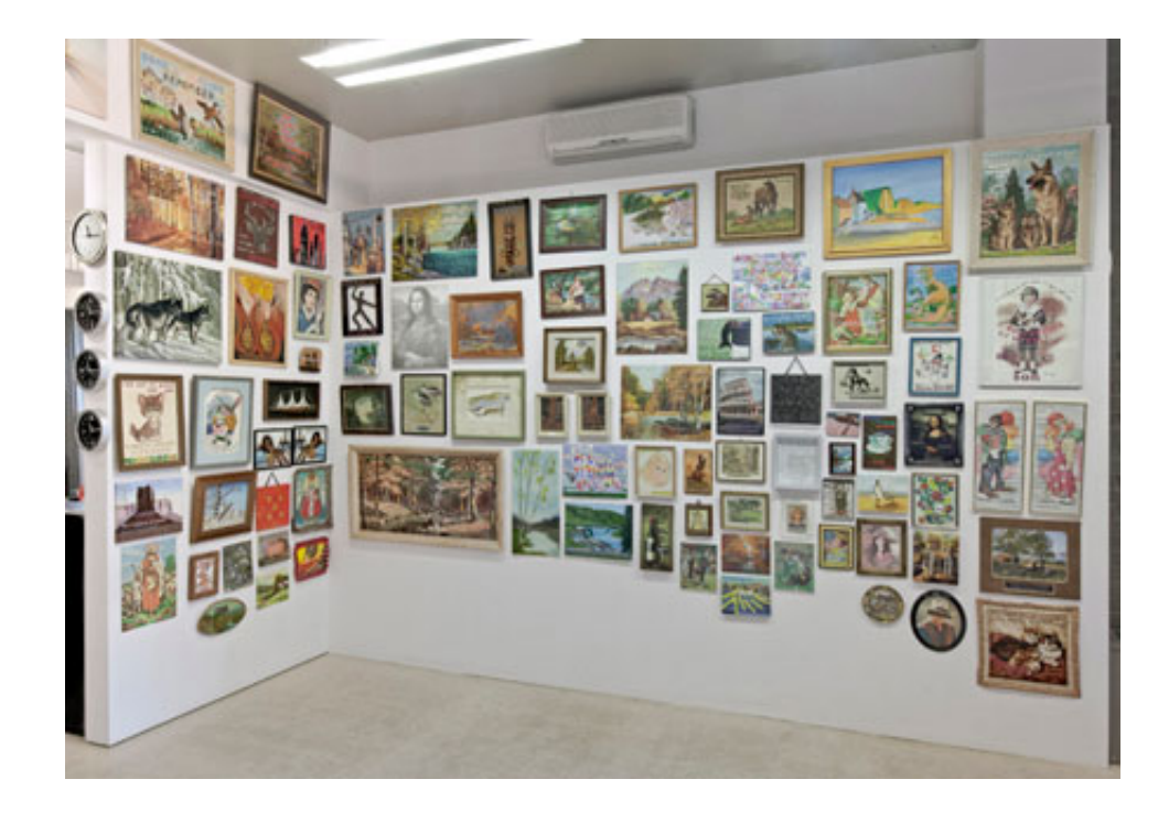
Laura Kikauka "Strength Thru Embarrassment" 2012 Installation

<u>Laura Kikauka</u>, whose art often consists of collected objects she arranges, alters and presents, has purged her pleasurable practice of all guilt. It's a major achievement when you consider the shame-fuelled model of our present culture. Fun has been deposed in place of ranking, competition and the desperate need to win. Witness the current state of our televised dreamscape. Its "reality" (conspicuous choice of words, eh?) consists of little more than the manufacturing of losers and winners; a repetitive, ritualized spectacle of humiliation and elimination with a climactic spurt of money and prizes.