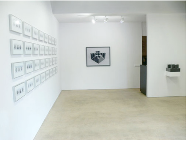
Roula Partheniou "100 Variations" 2008 Installation view

Subscribe to Canadian Art today and save 30% off the newstand price.