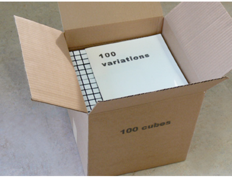
Roula Partheniou Possible Forms, (100 Cubes, instructions for 100 Variations) 2008

Partheniou's reformulated cubes are central to her larger project. After grey-scaling the blocks, she added new rules to the game. Engaging the sculptural and architectural qualities of her material, she set parameters for stacking and combining the units and laid out plans for stacked formations using simple mathematical calculations on paper. She then followed her renderings to create 100 variations of 100 stacked grey-scale Rubik's cubes. The resulting structures have an architectural quality. Optical illusions are at play as you move your eyes over the sculptures. It is a disorienting sensation because the light and shadow of the sculptures often does not correspond to the light in the gallery.