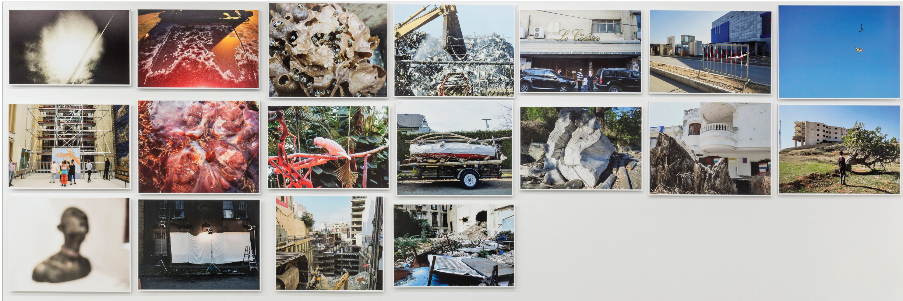
The visible world, through the ground, being and somethingness, reading in the air, from location/dis-location(s), c. 1999 - 2016. From: A history of photography (detail), MKG Gallery, Toronto, 2016.