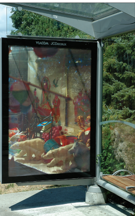
Sylvia’s shop, cabinet, previous wares holding their own , 245 Main St. (between Cordova & Powell St.), Vancouver, 7/6/04 (272); Renfrew St., Vancouver, from the ‘Territory’ project, transit shelter signage space photograph (prod. Artspeak & Presentation House, Vancouver, 2006; from location/dis-location(s) )