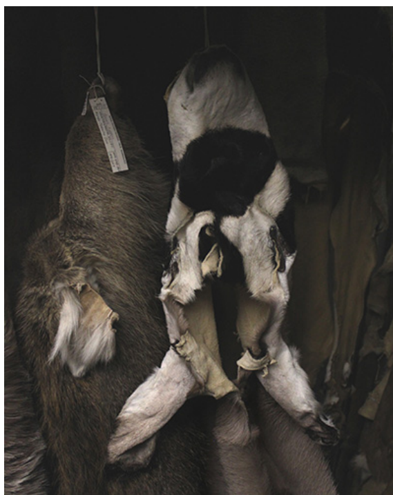
Brad Isaacs, You Can Never Go Back

London is rife with MFA exhibitions this month, including those of Liza Eurich and Brad Isaacs at McIntosh Gallery , located on Western University campus. In Eurich's installation The Work of It , seemingly self-explanatory material intentions quietly withdraw or are visibly interrupted. Something Like This , a small half-sphere covered in graphite aims through the eye of It Frames Them , a wooden rectangular loop propped up by limping shadows. Clay stains upon wood signal the threshold of having been marked for action, yet still on the edge of this action. The shadow produced by This One Has Been Bent , a reinforced steel line drawn from floor to mid-wall, transforms the piece into a slender frame, its wiry economy pulled out of line by a sudden curve. What He Said , a found image of a cat's aggressive snarl is cut short, its wood base sliced into a deliberately extended cliff of plinth. If you look closely, a possible rag in the cat's mouth pushes this cut into the driest of slapstick.